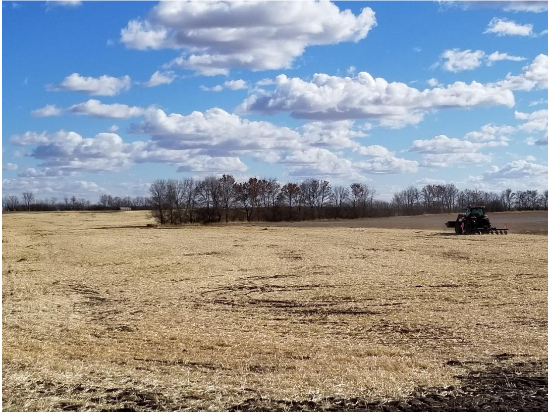
Straw Crimping the straw that was throw on the ROW.