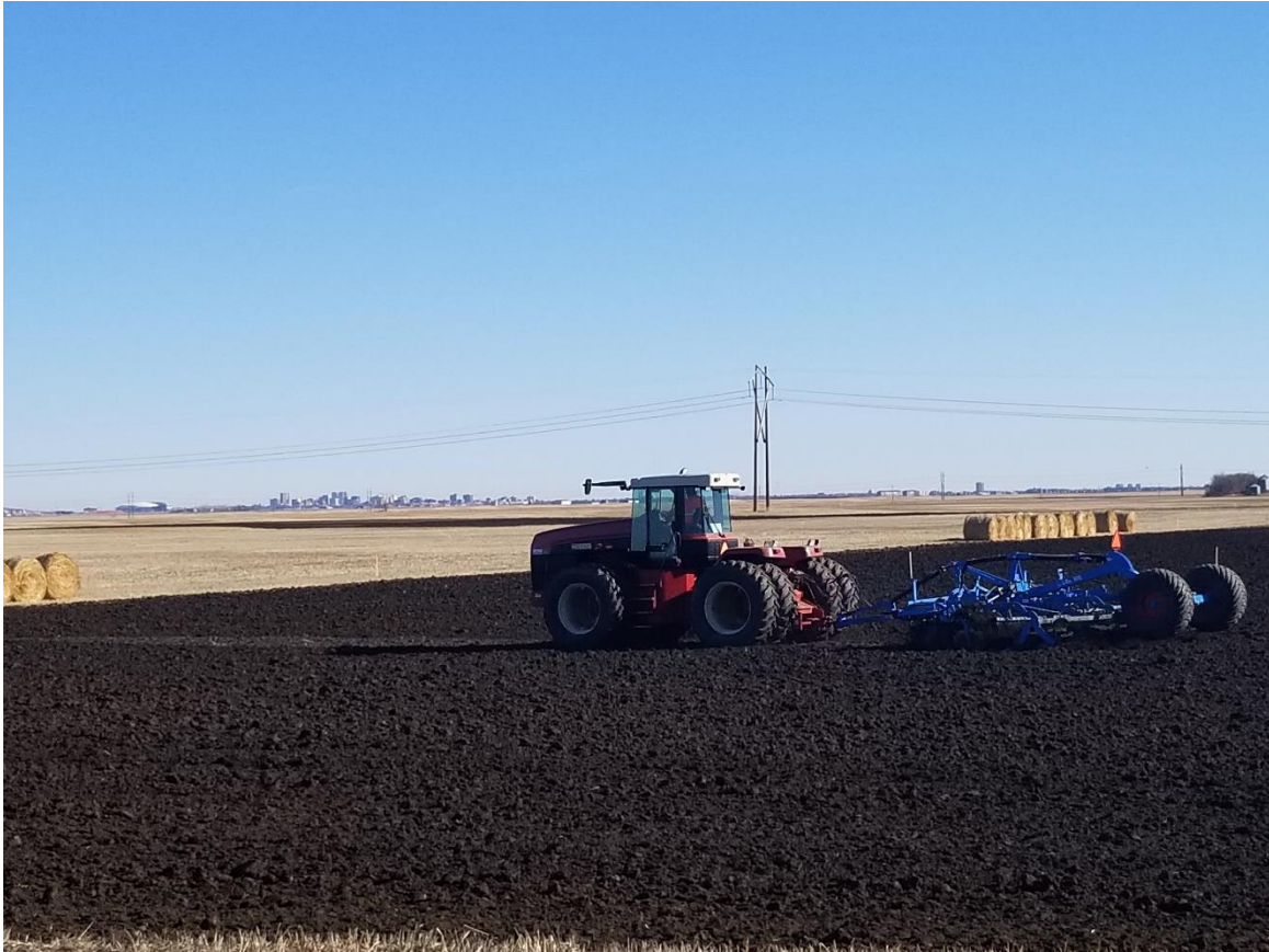
Discing the area of which the eventual Drainages to be installed.