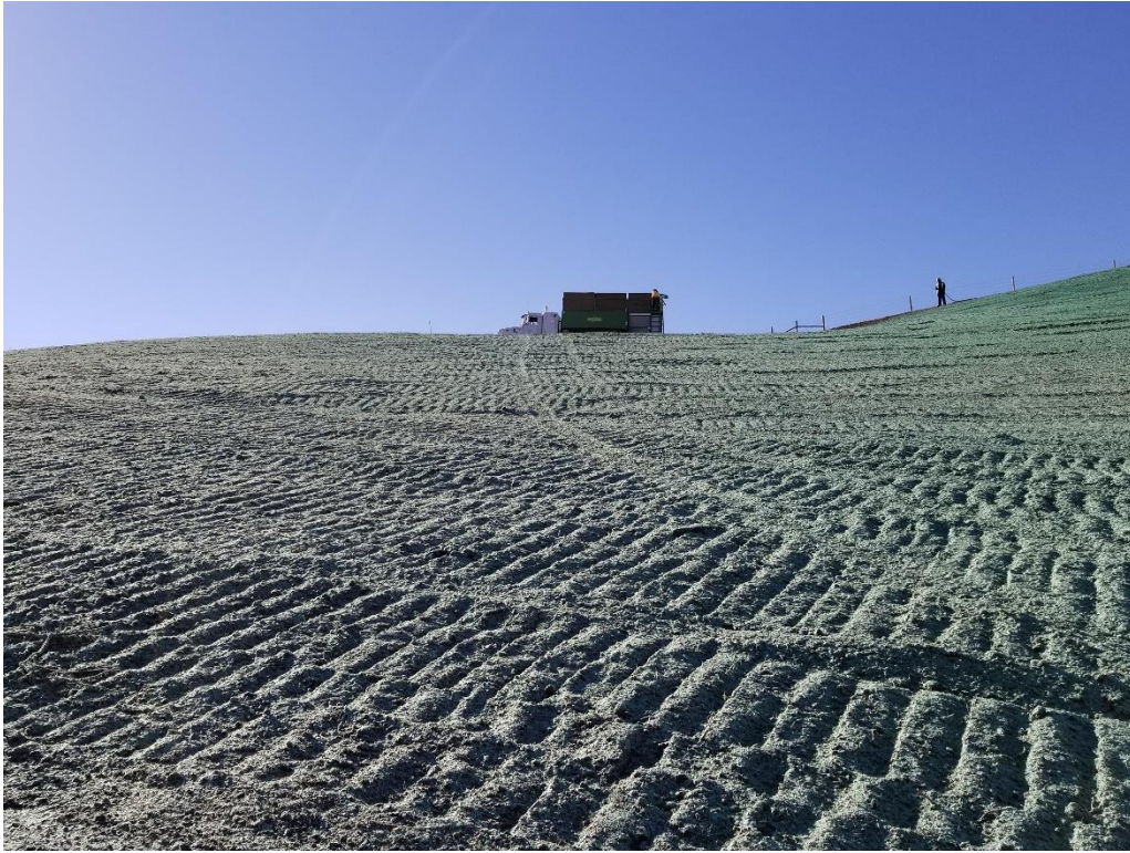
Hydro mulching in the Qu'Appelle Valley.